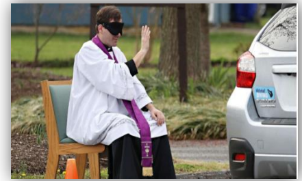
Drive in Confession

cases was a man who returned from the US, unknowingly carrying the virus. He went to Mass, and was a Eucharistic minister. All those who received the Precious Blood after him had to go into quarantine, yet not one caught the virus, and the man himself recovered quickly. Considering the contagiousness of the virus, this is rather extraordinary and reminds us of Christ's real presence in the Sacrament of Communion as well as the fact that God is not bound by the laws of nature which He made.