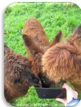
Three heads are better than one at eating time!

On Pentecost Sunday we rung bells as we always do to welcome the coming of the Holy Spirit, but this year we rang with special joy and vigour as people were now allowed to come and participate in the Holy Mass. Pentecost is often called the birthday of the Church, because it commemorates the coming of the Holy Spirit to the Apostles. That gave them the courage to go out of their lockdown and begin to spread the Good News of Christ. This year it really was a new birthday of the Church in New Zealand, at least in our diocese, and hopefully shortly for all places.