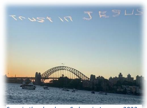
Seen in the sky above Sydney in January 2022

course and we will find one another again in the same place. We shall never be separated, for we live for Christ, and now we are united with Christ as we go toward him...we shall all be together in Christ" (CCC1690)